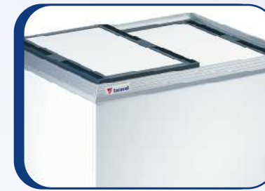
FOAMED SOLID SLIDING LIDS